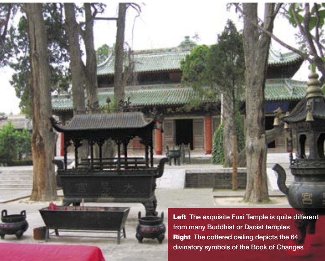
Left The exquisite Fuxi Temple is quite different from many Buddhist or Daoist temples Right The coffered ceiling depicts the 64 divinatory symbols of the Book of Changes