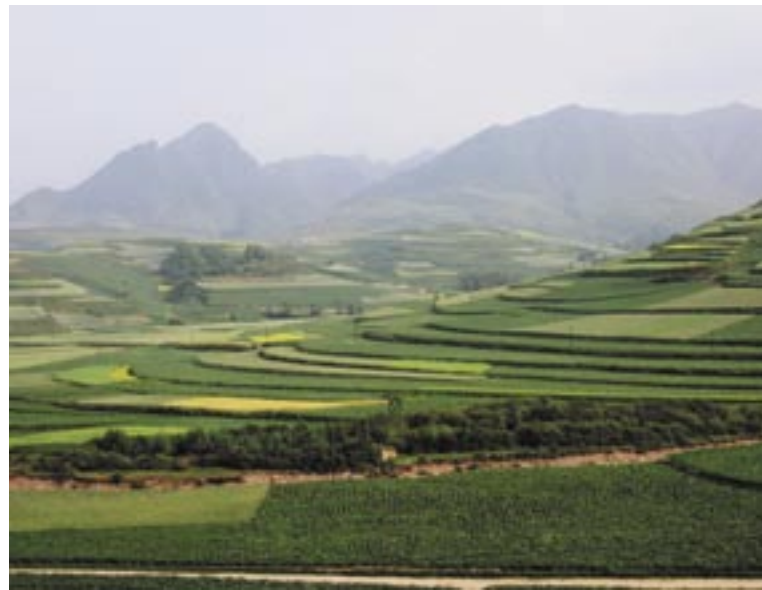
Layers of mountains enfolded like a weyr of dragons

Horse trekking through the pine forests of Songpan in the Min Shan range of Sichuan, we ascend from 2,900m to